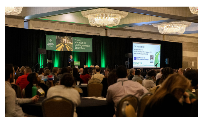
Over 800 participants from 250 institutions gathered in Atlanta for the 2024 NetVUE Conference in Atlanta, GA.

Financial support of NetVUE comes from a combination of membership dues and generous support from Lilly Endowment Inc.