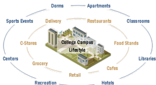
Hospitality Ecosystem Sample